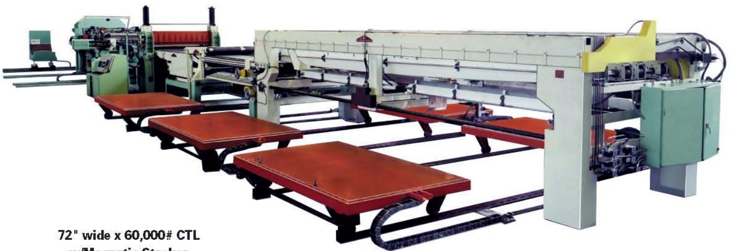
72" wide x 60,000# CTL w/Magnetic Stacker